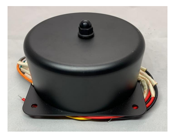
Optional steel case showed. Order number CA-004