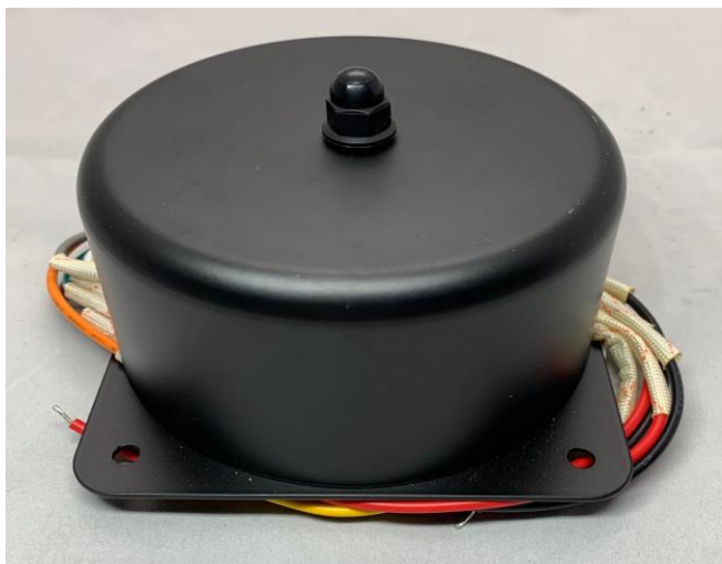
Optional steel case showed. Order number CA-002